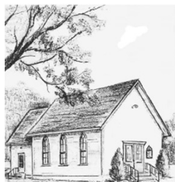
Drawn by...Mavis Tacheny

The original building's entrance was at the east (street) end and the altar was at the west-end (where one now enters the sanctuary). Over time, newer pews were added, the mechanicals and organs were updated, and building additions were planned and built.