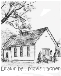
Drawn by...Mavis Tacheny

The original building's entrance was at the east (street) end and the altar was at the west-end (where one now enters the sanctuary). Over time, newer pews were added, the mechanicals and organs were updated, and building additions were planned and built.